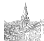
The Annunciation New Mills www.stmarysnewmills.org.uk