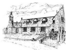
St Mary Marple Bridge